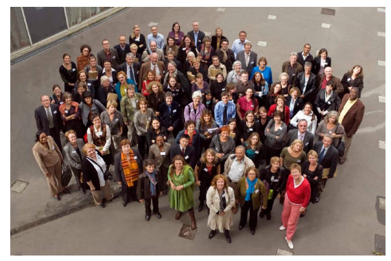
EuroNGOs participants in Lyon, France

This year's meeting of the European NGOs for Sexual and Reproductive Health and Rights, Population and Development (EuroNGOs) was held on 2 and 3 October in Lyon, France. More than 120 participants from 21 European Countries as well as from Canada, the USA, Kenya, Japan and New Zealand participated. Representatives from the Family Planning and SRHR constituency as well as from the environmental sector, gathered together with environmental, development and demographic experts, stakeholders from private European and US-Foundations as well as from UNFPA in order to discuss how to respond to the growing attention to environment and a changing global economy.